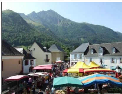
Marché dominical d'Arrens

Dates are August 16-20 in Arrens-Marous(65400), France.