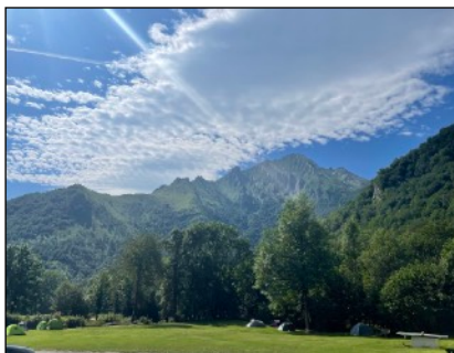
Vue depuis la Salamandre